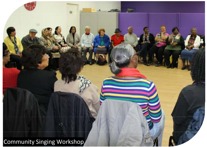
Community Singing Workshop