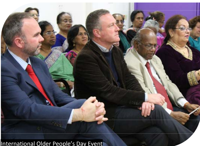
International Older People's Day Event