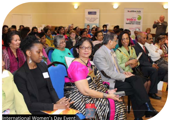
International Women's Day Event