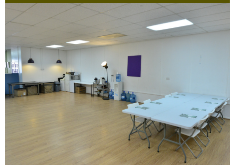
Community Meeting Space

We also have an IT suite available for groups to hire, with access to projector and projector screen. Space is also available for groups wishing to have their AGM, Conferences & Seminars accommodating up to approximately 100 people seated.