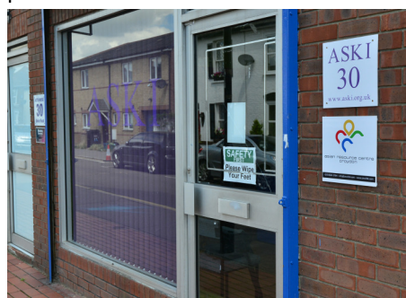
Ground floor entrance at Union Road and the new look ARCC office space.

From September 2014 to meet the needs of our groups ARCC will be open one Sunday per month, and like GP surgeries will offer “SKYPE Capacity Building Consultations” to groups who are unable to attend the office.