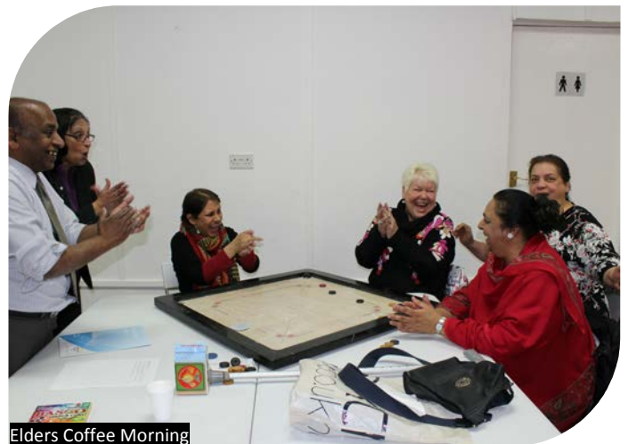
Elders Coffee Morning