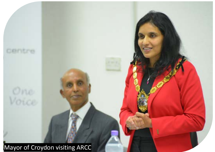
Mayor of Croydon visiting ARCC