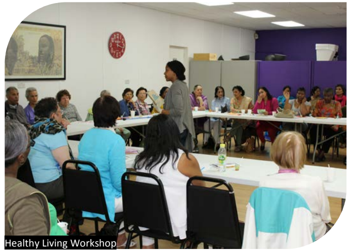
Healthy Living Workshop