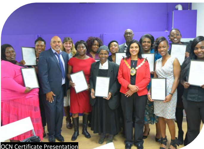
OCN Certificate Presentation