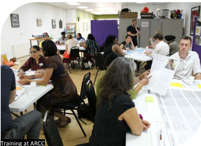
Training at ARCC