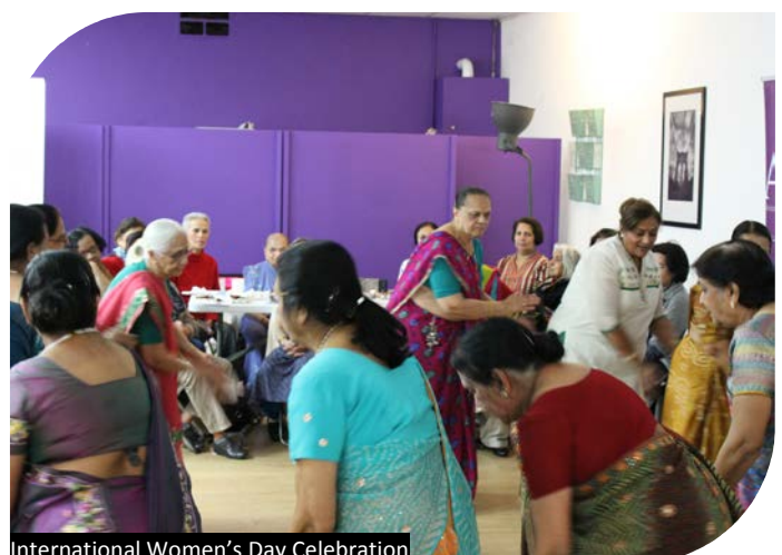
International Women's Day Celebration

Please note this is a summarised version of the Annual Accounts. A full set of accounts is available upon request via email to info@arccltd.com