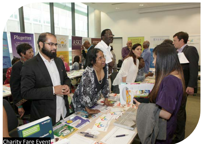
Charity Fare Event